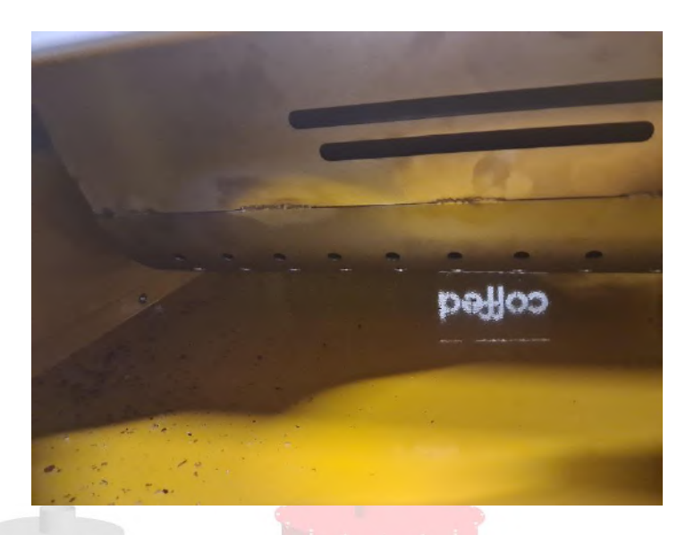
Reduce of coffee husks collected along the entire roasting line