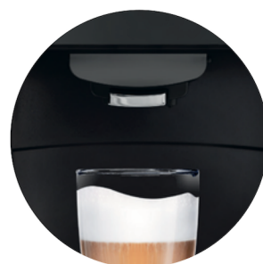
automatyczne czyszczenie systemu mlecznego