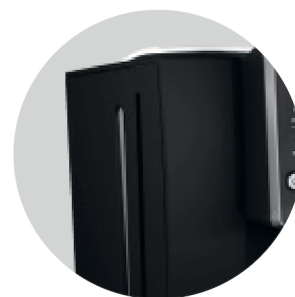
2-litrowy zbiornik wody