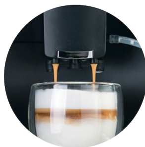
funkcja One Touch Cappuccino