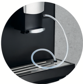
automatic milk system cleaning