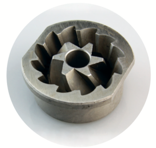
steel conical burrs