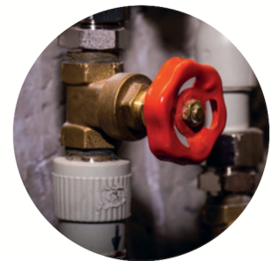
optional water mains connection* - MODEL X65 PLUS