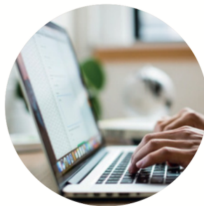
statistics on email