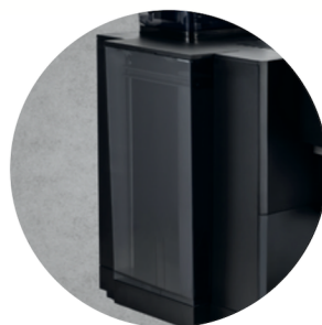
4-liters water tank