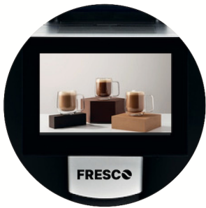
7" display with videos play possibility